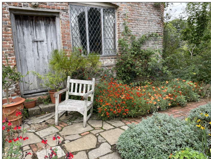
This one was taken at Sissinghurst Castle and Garden in southern England.