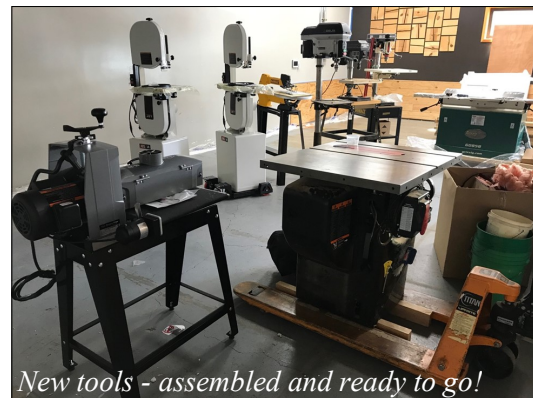
New tools - assembled and ready to go!