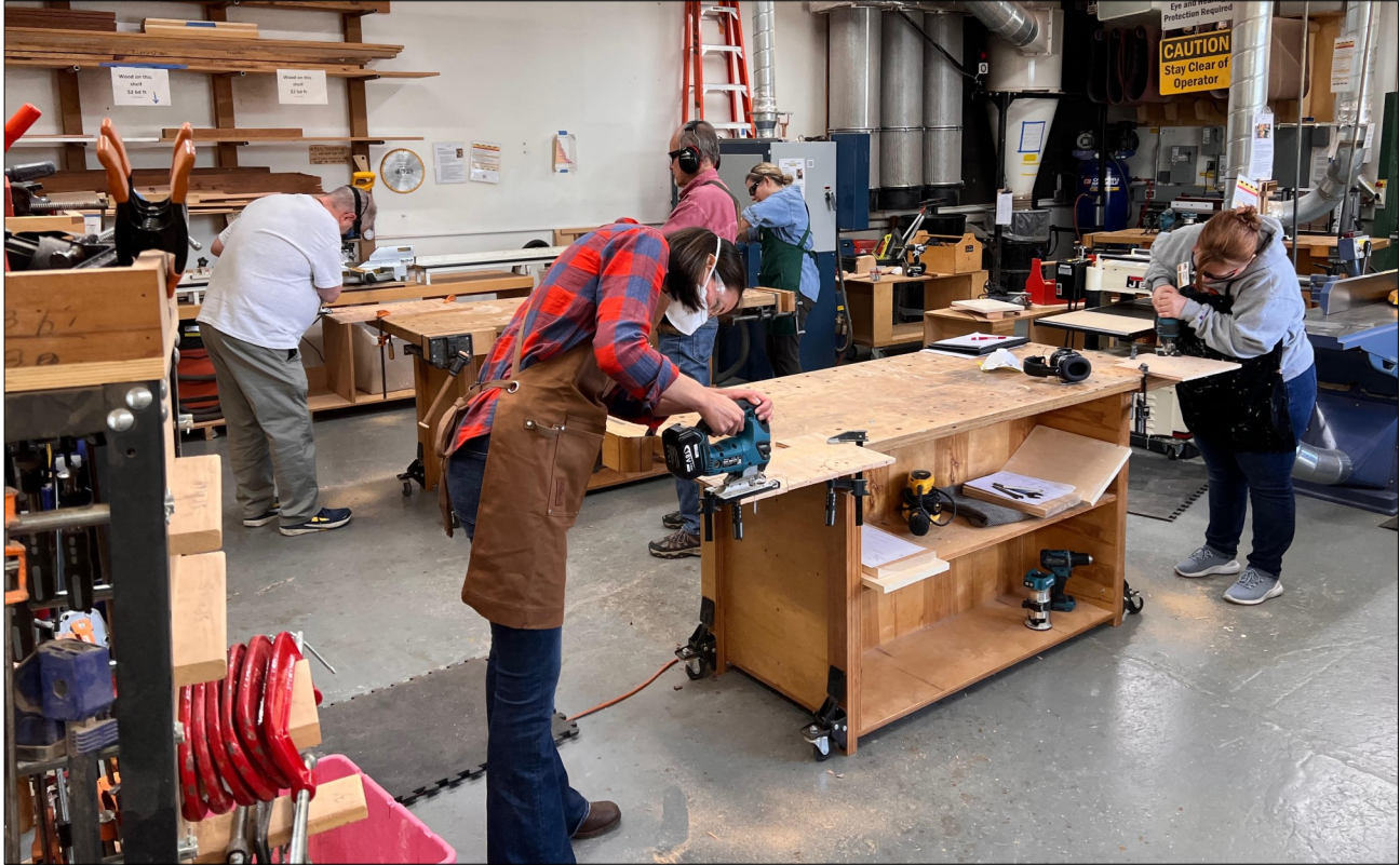
Getting Started with Portable Power Tools class