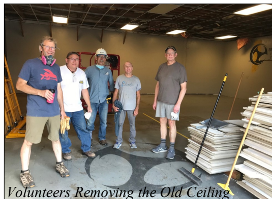
Volunteers Removing the Old Ceiling