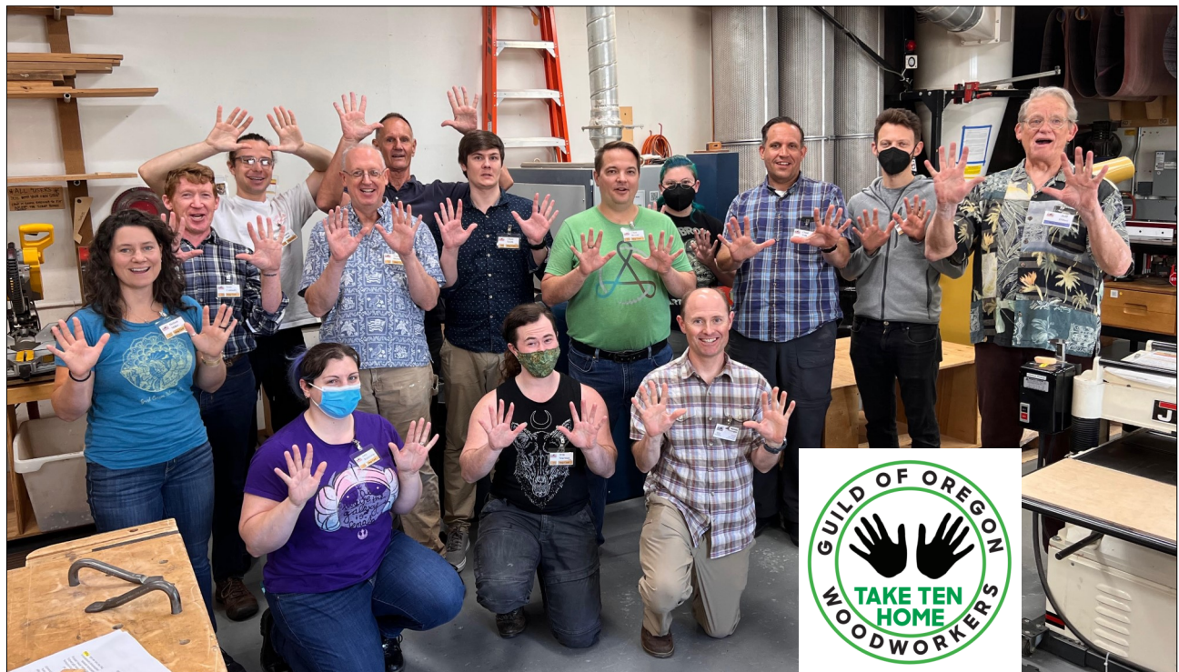
Intro 9 20 22, shouting a woodworker swear word, "Tear out!" with the Instructor (standing on right).