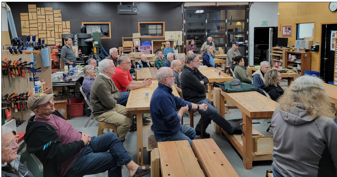
A recent General Meeting.