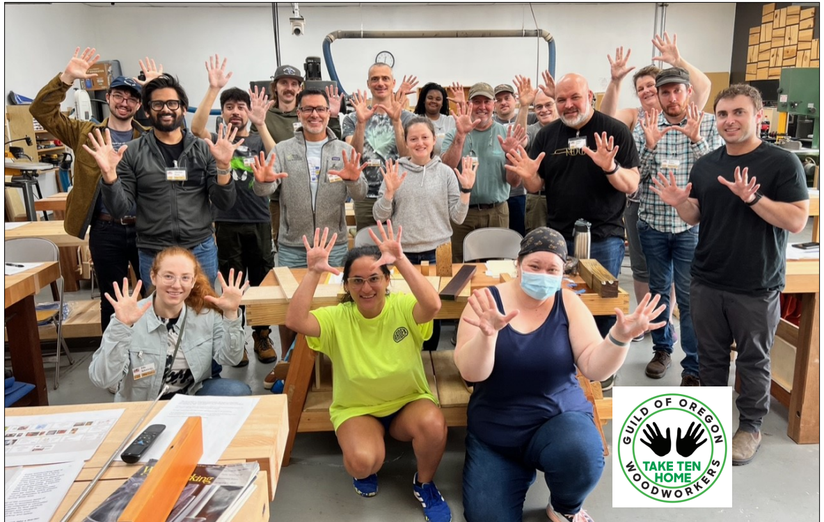
Awesome display of advanced technology, Introduction to Guild Safety , 10/24/23

A first step for new Guild members, The Take Ten Home Club in Introduction to Guild Safety classes. 10/7/23