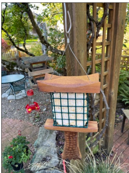
Jim Spitzer's Bird Feeder

Three blocks east of the Alberta St. exit off I-5.