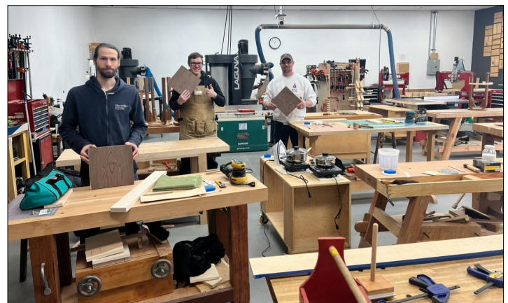
Hammer Veneering, an introduction to veneer. One project was a book-matched walnut panel.

Upcoming classes are posted on the bottom right of the Woodworking Classes page. For the full list of education & shop training classes go to: GUILD EDUCATION CALENDAR