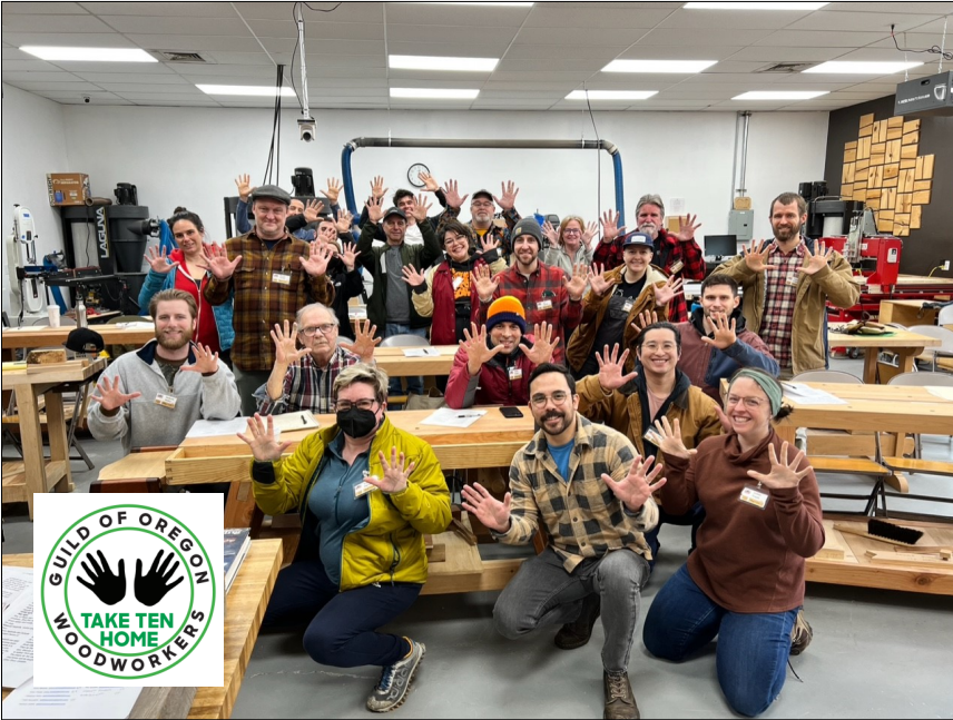
Introduction to Guild Safety , Two hundred ten new additions to the The Take Ten Home Club, 3/5/23.