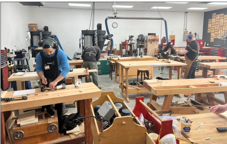
Getting Started , with portable power tools. Learning how to be ambidextrous with four hand-held tools