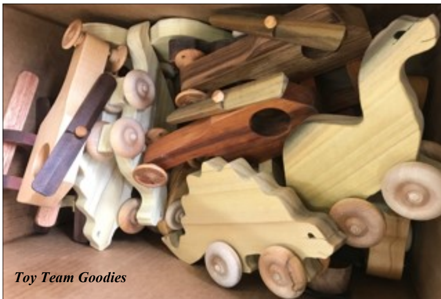
Toy Team Goodies

If you have additional questions you can find FAQ's on the Guild website under Member->Volunteer->Volunteer Appreciation Program on the Guild's homepage.