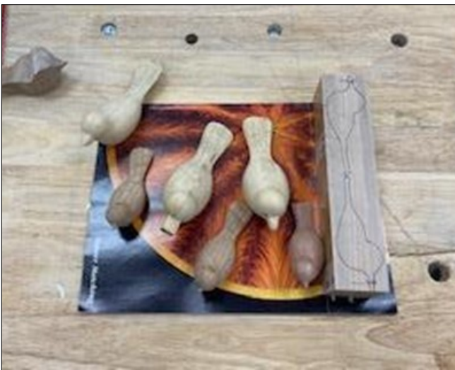
Tracy Whalen's growing flock