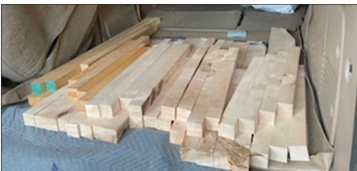
Tom Willing's big leaf maple milled into blanks for the CNC SIG for birds.