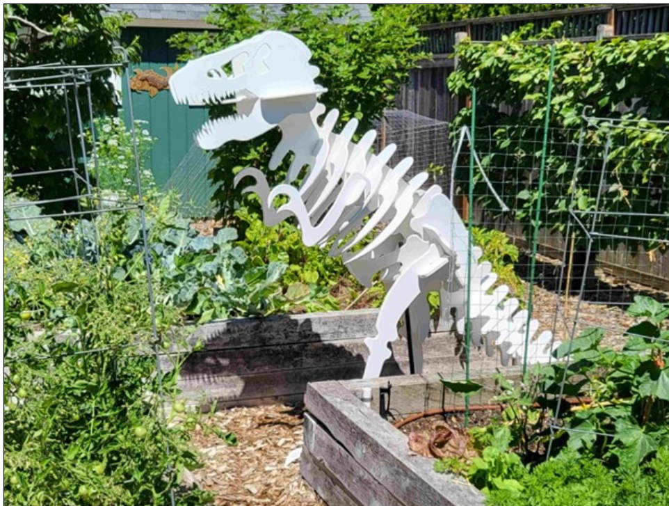
On raccoon duty in the vegetable garden