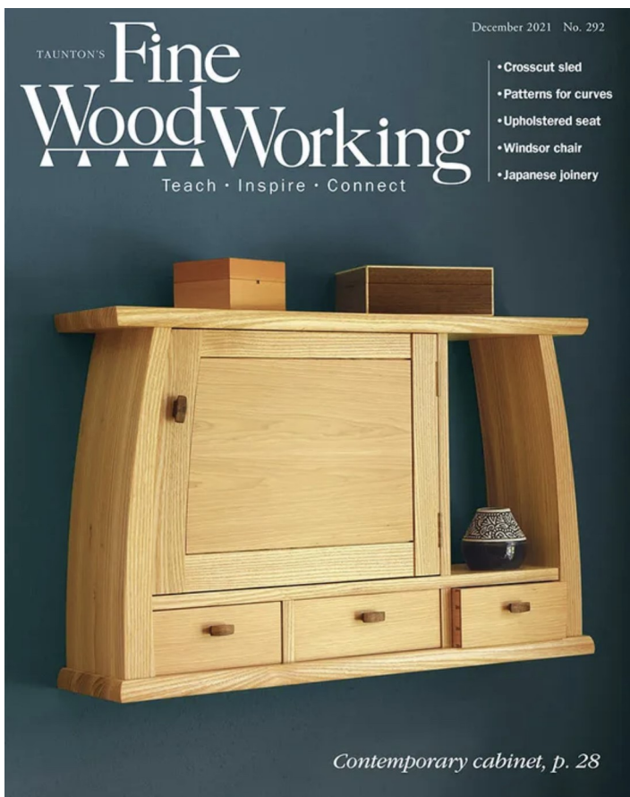
Contemporary cabinet, p. 28

Mark your calendars for January 15 through 21. 9 AM to 5 PM for this exciting workshop and watch the Guild website to register.