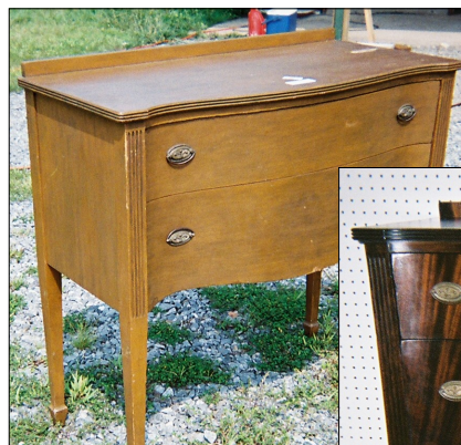
Flame Mahogany - before and after of a yard sale find turned into an heirloom. This piece is called a server and was coated with paint hiding the beautiful crotch mahogany veneer. This now resides in Lebanon, KY.