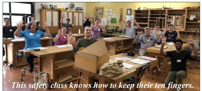
This safety class knows how to keep their ten fingers.