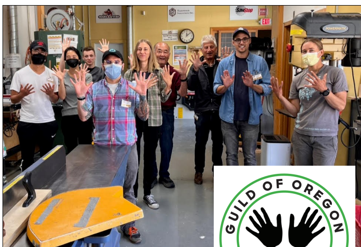
Introduction to Shop Safety - Aug 2