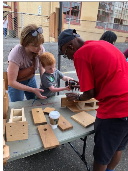
Project Build Team volunteer helping kids to build birdhouses.