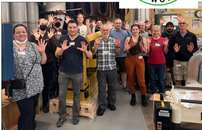
That new green planer is only for wood. The Take Ten Home Club, Aug 21