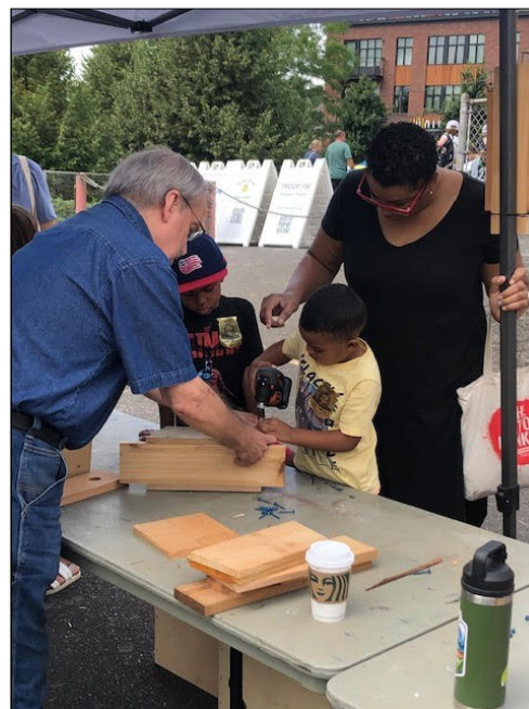
Project Build Team volunteer helping kids to build birdhouses.