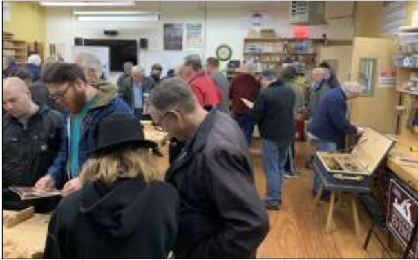
Lie Nielson Hand Tool Event in February.