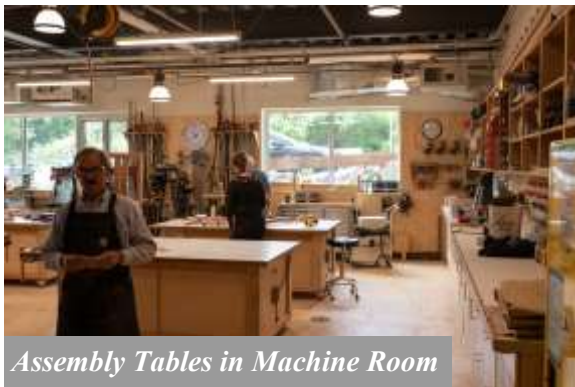
Assembly Tables in Machine Room

ber or non-member, must complete the same orientation and studio specific safety training before participating further. BARN does not use a HOST type test in lieu of training option, every studio user must go through an Orientation training, and two separate three-hour machine training classes. It appears these sessions are offered every week. Another important difference is that their machine room Monitors (SA) are dedicated full time to the machine room. They are charged with continuously scanning the room during the three-hour shop sessions, except for relief, a separate Shop Manager can substitute. The Shop Manager mans the bench room, and takes care of sign-in & out, as well as monitoring qualifications of users. The BARN woodworking studio is about twice the size of ours, so there is a lot to keep track of, and this two-person staffing makes a lot of sense for enhanced safety.