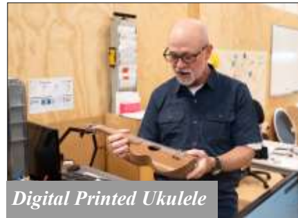
Digital Printed Ukulele

The entire facility has a specialized HVAC, fume and dust control (DC) custom to each studio. Their DC system is located outside of the building, contributing to a quieter shop environment. It is a system that employs a filter chamber where process air enters from the outside of an array of