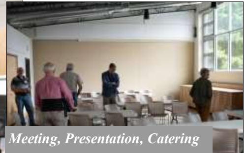
Meeting, Presentation, Catering