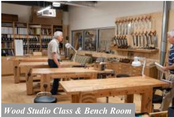
Wood Studio Class & Bench Room