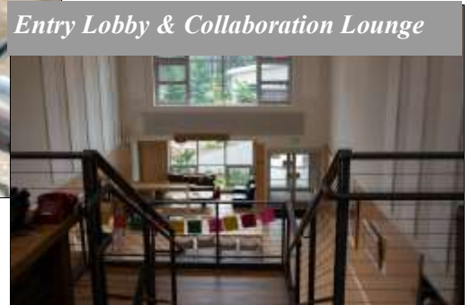
Entry Lobby & Collaboration Lounge

that would enable cross fertilization between these various disciplines.