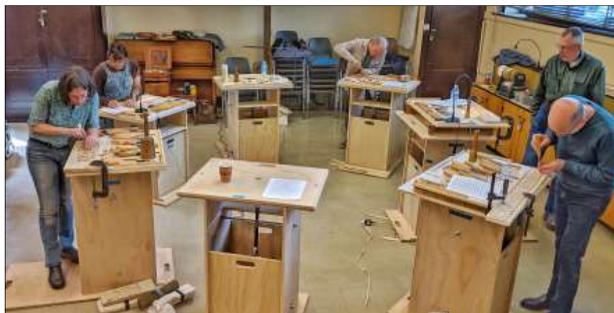
Our class using the portable carving stations designed and fabricated by Larry Wade and the Project Build Team. We can serve more students by hosting classes away from the Guild shop.