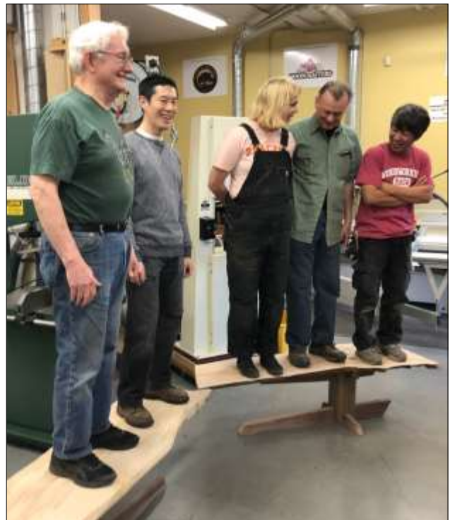
Students from the class test the strength of their tables by standing on them.