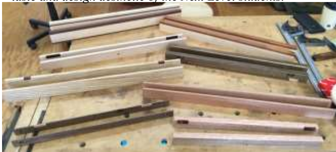
A pair of winding sticks. Many users find the inlay makes sighting easier.