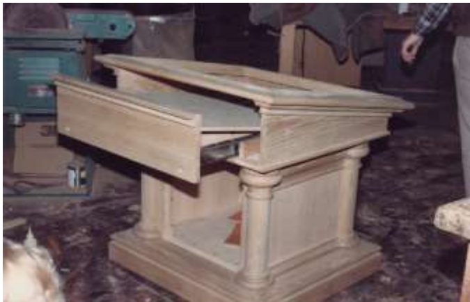
Cabinet alone 1986