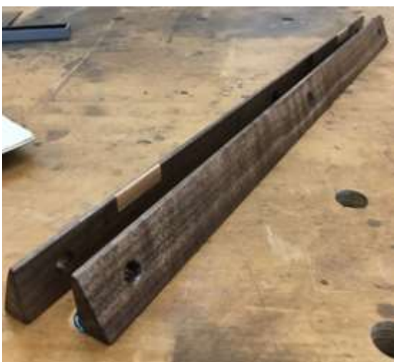
The eight sets of winding sticks reflect individual taste and design aesthetic of the Next Level students.

The homework last month was to make winding sticks using hand tools, so we started with our monthly critique. Placing two straight and square sticks in parallel at opposite ends of a board emphasizes the "out of plane-ness" of your stock so you know where to focus your flattening efforts. Winding sticks don't have to be fancy to work, but we all wanted to grow our skills; everyone ended up with good stories about efforts gone wrong and lessons learned. Many of us started with Paul Sellers' instructions for winding sticks and discovered that sawing diagonally the long way through narrow stock to create matching trapezoidal sticks is not as easy as he makes it look. Classmates experimented with inlay, carving tools, unfamiliar woods and fuming oak with ammonia and shared what worked and what did not. The monthly critique of our projects is one of the most useful aspects of the NL class series; reflecting