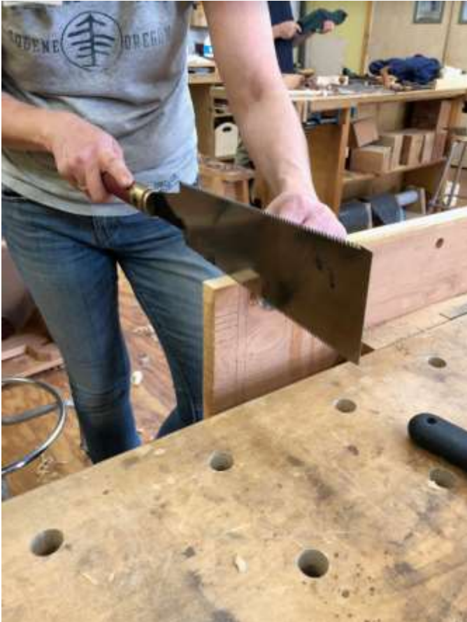
Cutting to length, keeping it straight.

er. This becomes a pair of reference surfaces that can be used to square up one side of end grain with a shooting board. Then the process begins again, this time flattening the unfinished face until it's square to the reference edge, squaring the final unfinished edge, and finishing the end grain.