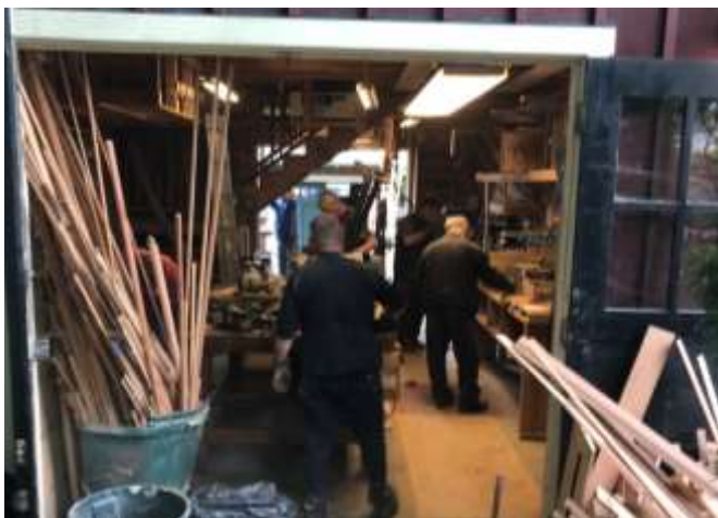
Photo 2 is a cleaned out shop.

Photo 1 is 6 guys cleaning a shop. This shop was a mess. 2 inches of Saw dust and the owner had never gotten rid of any scrap wood for years. We took three loaded pickup loads to the dump and culled out another load or two of scrap for firewood.