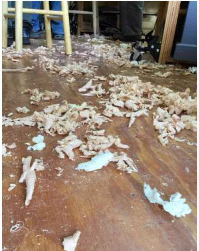
Shavings at the end of a good day at the bench.