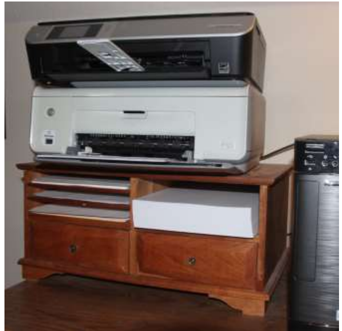
My version of the printer stand

Search the Wood Magazine site for "printer stand" the plans are $5.95 unless you have that back issue.