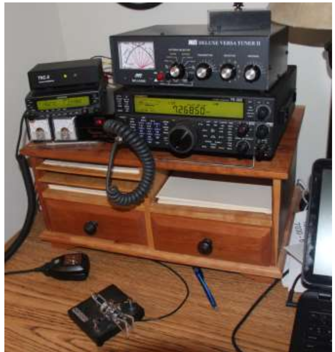
My ham radio printer stand