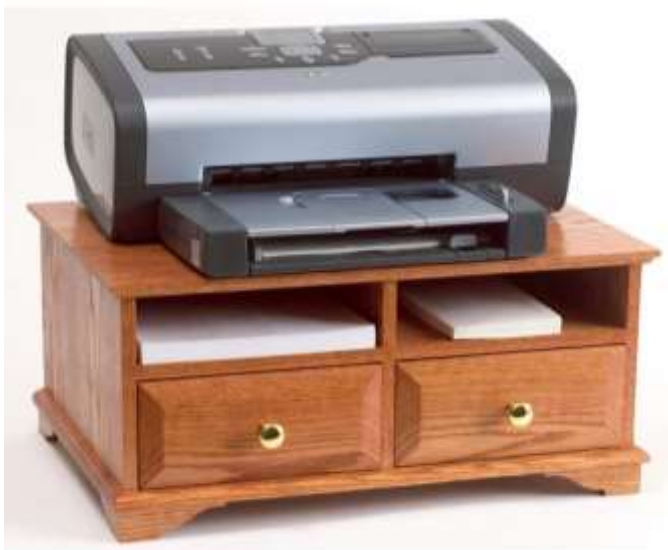
Printer stand as shown in Wood Magazine

It measures 22" wide, 13" deep and 9 1/2" tall. The router trim around the top and bottom make it very stylish. The feet of course add quite a touch of class, and make it easy to lift.