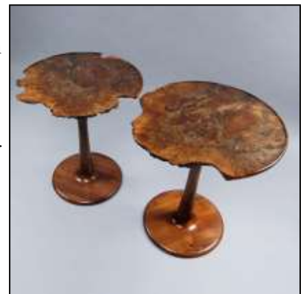
(Continued on page 2)

Austin's use of live edge will be the focus