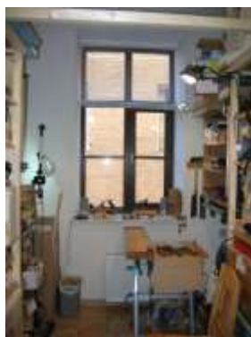
6x6 shop in Riga

Now I am well-positioned to finally learn to practice what I have read so much about, and the Guild is a perfect partner for me. It gives me the chance to learn from profes-