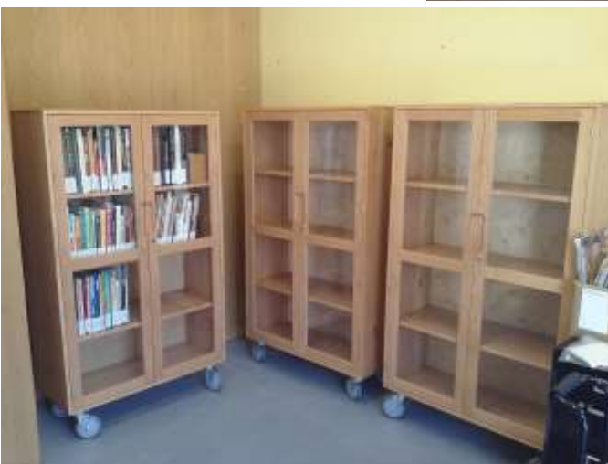
New bookshelves for the Guild library

this year, all the departments have done a great job staying on budget, including the complex job of running the workshop. In July we will review and adjust the budget if needed. Why is this important? The Guild has a cash flow of over $100,000 a year. It is a small business that needs to be managed just like any other business. The budget provides a framework for each department to make good decisions.