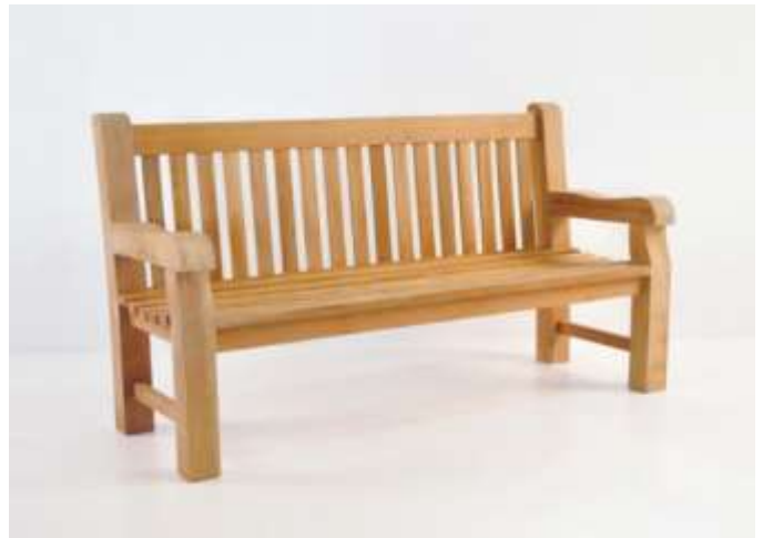
An example of the benches we will build.

503-774-5123 or bandjoconnor@comcast.net .