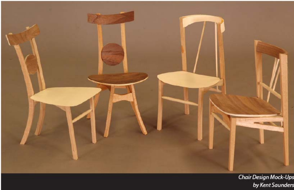
Chair Design Mock-Ups by Kent Saunders

1002 SE 8th avenue Portland, OR 97214 (503)-284-1644