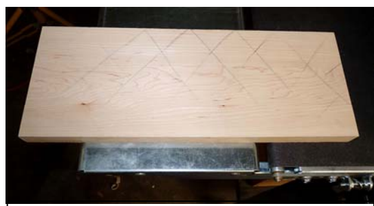
the third one reveals the truth about hard maple!

depth setting. Don't be fooled if it takes all of your pencil marks off the first time or two. Just remark it