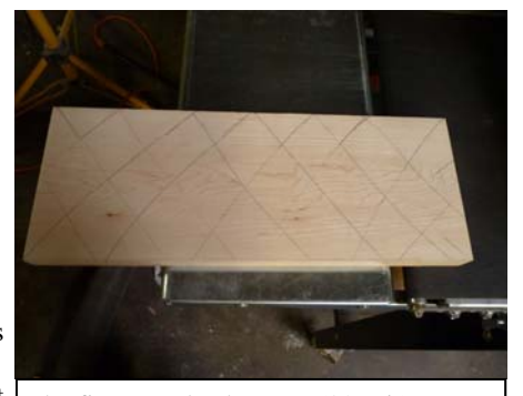
The first two dead passes (80 grit) removed all of the pencil marks, but...

hard board that you know has flat, parallel faces, and run it through. Take a moderate cut – enough to clean the entire face of the board. When it comes out, make a few pencil lines that go all the way across the face you just sanded. Now send it back through in the