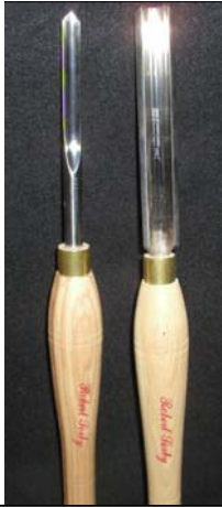
Tool of the Month